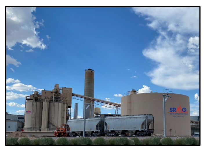
SRMG Tucson Terminal

In recent years securing a consistent supply of high-quality fly ash has been a challenge for some of the United States construction markets. Salt River Materials Group (SRMG), a fly ash and pozzolan marketer in the Southwest U.S. since 1973, understands the challenges of maintaining sufficient availability of quality products. For the past four decades, SRMG focused investment on innovative projects, such as beneficiation of otherwise unusable fly ashes, and now blending various sources of fly ashes and